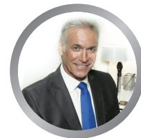
Dr Hilary Jones, Medical Broadcaster, GP

Contrary to popular belief, under normal operating instructions, not all bacteria on masks are killed in the microwave. In Ideal conditions and without Sterileyes®, bacterial numbers can double over a 20 minute period.